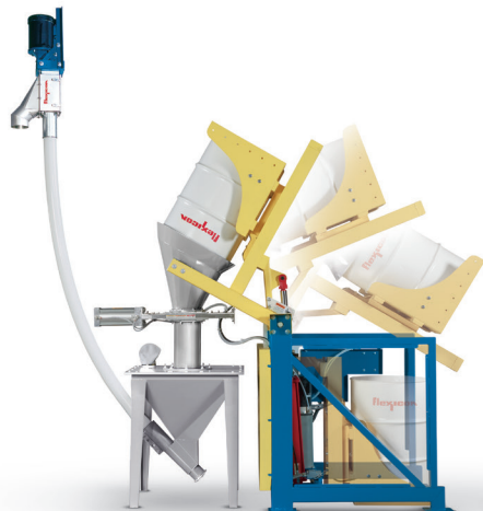
TIP-TITE® Universal Drum Dumper handles drums from 30 to 55 gal (114 to 208 liter)