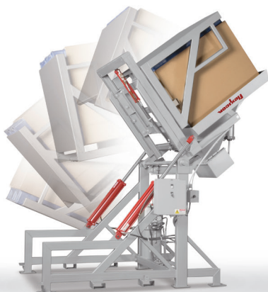
TIP-TITE® Box/Container Dumper handles boxes up to 48 in. W x 48 in. D x 44 in. H (1220 mm W x 1220 mm D x 1118 mm H)