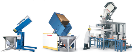
Also available (left to right): Open Chute Drum Dumpers, Open Chute Box/Container Dumpers and High Lift Drum Dump Filling Systems

Most importantly, all are engineered, manufactured, guaranteed and supported by Flexicon—your single-source solution for virtually any bulk handling problem.